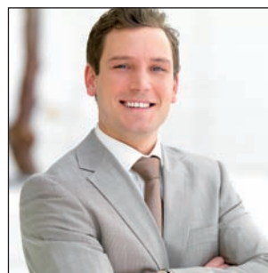
3 John / 28